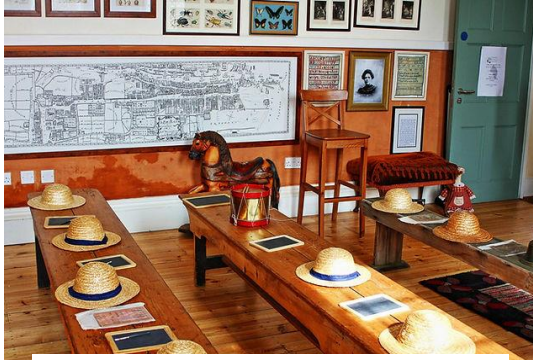
Donnison School Heritage

The Events Team invite you to experience the Heritage of Sunderland. Visit Donnison School Heritage Hub, The Sunderland Maritime Museum and the Holy Trinity Church