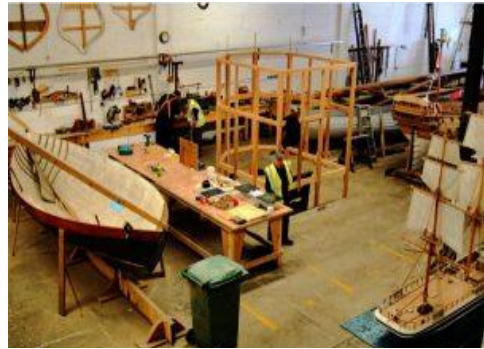
Sunderland Maritime Museum