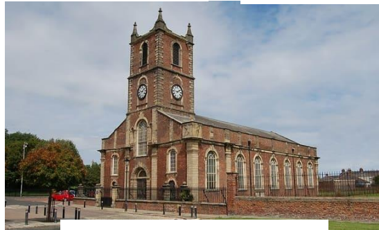
The Holy Trinity

Each venue is within easy walking distance of each other.