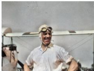
Geoffrey de Havilland (1882-1955)